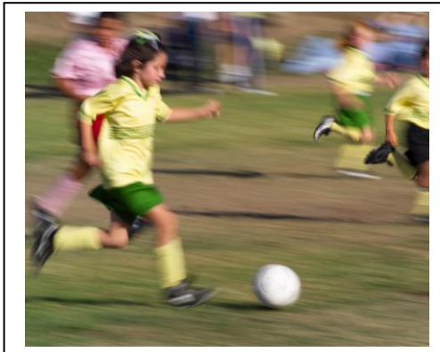
Some girls were playing soccer.