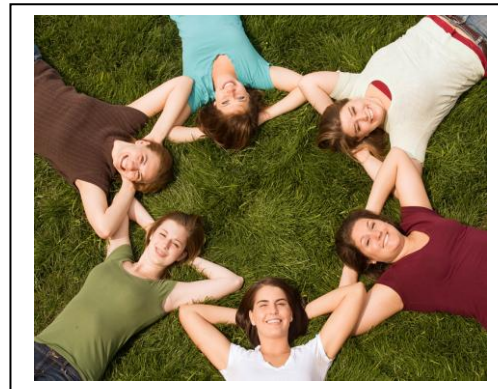
The others were lying in the sun.

[‘The others’ is replacing ‘the other girls,’ so it’s a pronoun. Pronouns change for singular or plural. ]